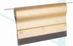
All-aluminum ergonomically shaped squeegee holder with Poly-Supreme™ Vulkollan squeegee blade (included)