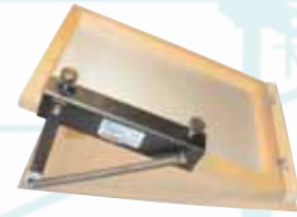
Heavy Duty Reversible Side Kick ( included )