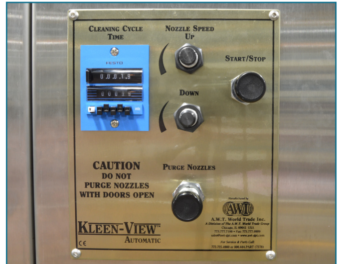
From the convenient control panel, the operator can start/stop cleaning operation, view cleaning time, increase or decrease the nozzle speed and even purge any water remaining in the nozzles.