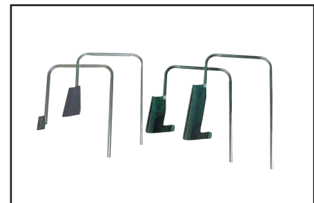
Quart, Gallon, 3.5 Gallon and 5 Gallon Blades

Maximum: 5 gal. or 25 liters Diameter: 14" (35cm)