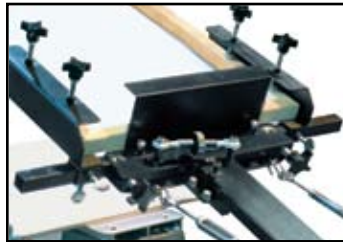
Multi-directional X/Y micro-registration system