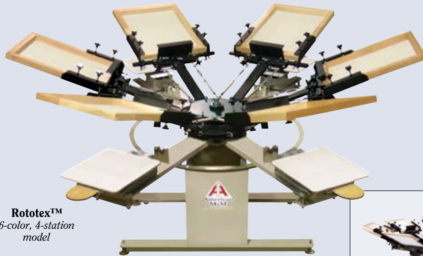
Rototex™ 6-color, 4-station model