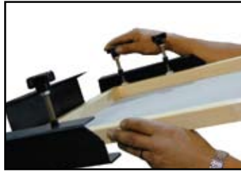
Adjustable side screen clamps

And for bigger jobs, the arms down print facility lets several operators work together as a team during long runs