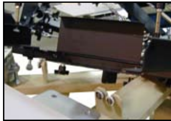
Lock-in heads with hardened steel eccentric bearings