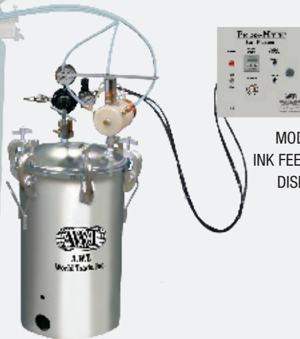
MODEL PM-5A SHOWN INK FEEDER WITH AUTOMATIC DISPENSING CONTROL